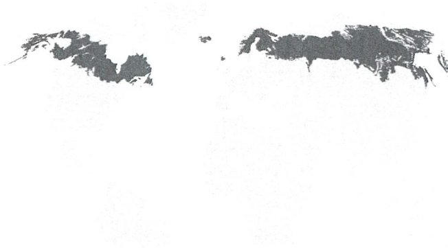
Map of Taiga Biome